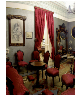
Noble hall, decorated with family portraits