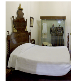
Elizabethan style bedroom, XIX century

Joan Maragall and his family moved into the house in Alfons XII in 1899. The residence, which has remained to this day as a gathering point for the family, shows today an example of a bourgeois home at the Barcelona from a century ago.