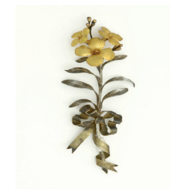
Englantina d'Or. Prize for the poem "La sardana", won the Foral Games, 1894

The visiting areas are the hall, the noble hall, the living room, the office and two bedrooms where some objects of the poet and his family are kept.