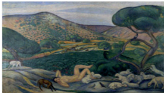
Pastoral , of Joaquim Sunyer (1911).

A comprehensive critical collection of different authors on Maragall's work, the original and printed scores from more than one hundred musicians on poems by the author, the iconographic collection (drawings, engravings, photographs, paintings, etc.) and about 10.000 press clippings complete the holdings of the centre.