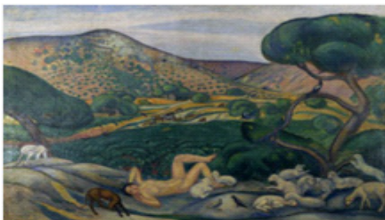
Pastoral , of Joaquim Sunyer (1911).

A comprehensive critical collection of different authors on Maragall's work, the original and printed scores from more than one hundred musicians on poems by the author, the iconographic collection (drawings, engravings, photographs, paintings, etc.) and about 10.000 press clippings complete the holdings of the centre.