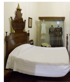
Elizabethan style bedroom, XIX century