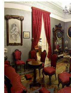
Noble ghall, decorated with family portraits