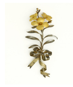
Englantina d'Or. Prize for the poem "La sardana", won the Foral Games, 1894

Joan Maragall and his family moved into the house in Alfons XII in 1899. The residence, which has remained to this day as a gathering point for the family, shows today an example of a bourgeois home at the Barcelona from a century ago.